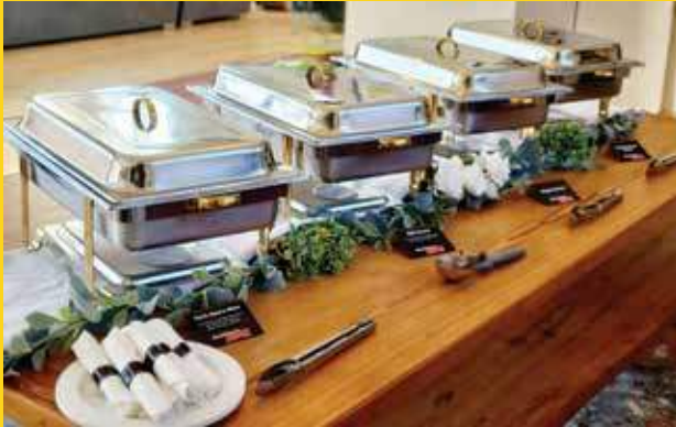
Chafing racks with silver and gold finishes.