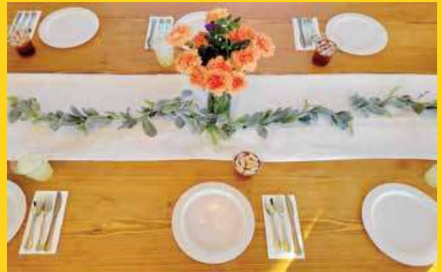
Disposable white plates, clear plastic cups, silver disposable utensils, and paper napkins.