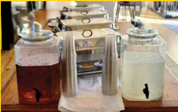
Glass drink dispensers with clear plastic cups.