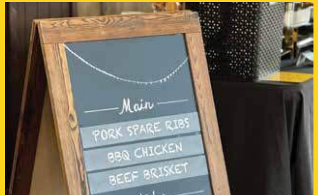
Rustic menu board